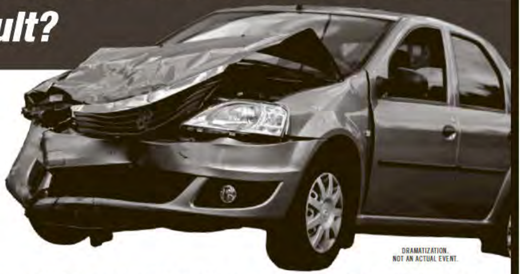
DRAMATIZATION. NOT AN ACTUAL EVENT.

FREE Consultation • Hablamos Español • We'll Come to YOU.