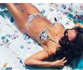
Kai Lani Instagram