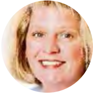
BY SUSAN SELASKY

Q: Is quinoa a grain or seed? How do you prepare quinoa so it’s not mushy? A: These questions about quinoa come up often. Although quinoa (KEEN-wah) is a seed that comes from the goosefoot plant, it’s commonly put into the grain category for a couple of reasons. (Quinoa is also related to spinach and beets.) First, it’s treated like a grain because you cook it