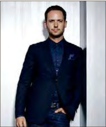
Patrick J. Adams stars in 'Suits' on USA Network.

8 PM 2 42 Supernature — Wild Flyers The new three-part mini-series concludes with “Crowded Skies,” a telling title for the phenomenon the hour deals with. Indeed, for as big as the sky appears, it can be a smaller place for those who have to negotiate it skillfully in order to survive. Birds, insects and other creatures occupy it, each needing its space — and sometimes competing for it. Sophisticated cinematography details the nature (in every sense of that word) of that struggle.