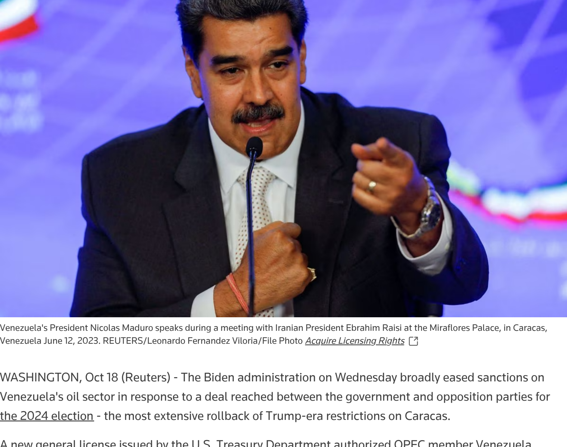
Venezuela's President Nicolas Maduro speaks during a meeting with Iranian President Ebrahim Raisi at the Miraflores Palace, in Caracas, Venezuela June 12, 2023.

WASHINGTON, Oct 18 (Reuters) - The Biden administration on Wednesday broadly eased sanctions on Venezuela's oil sector in response to a deal reached between the government and opposition parties for the 2024 election - the most extensive rollback of Trump-era restrictions on Caracas.